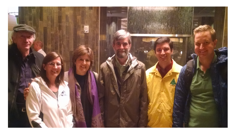
2014 at Internet2 Technology Exchange in Indianapolis