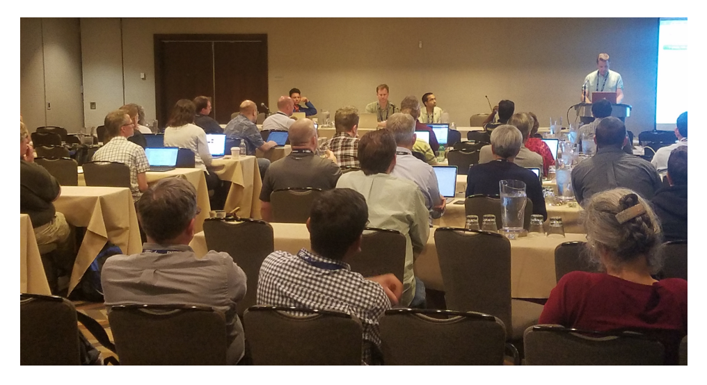
2017 Grouper session at Internet2 Technology Exchange in San Francisco