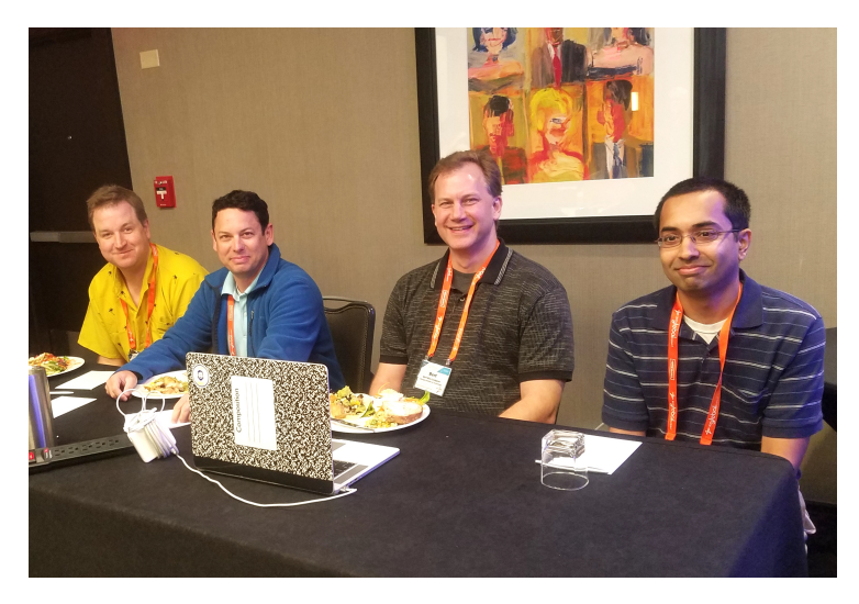
2017 Grouper BOF at Internet2 Technology Exchange in San Francisco