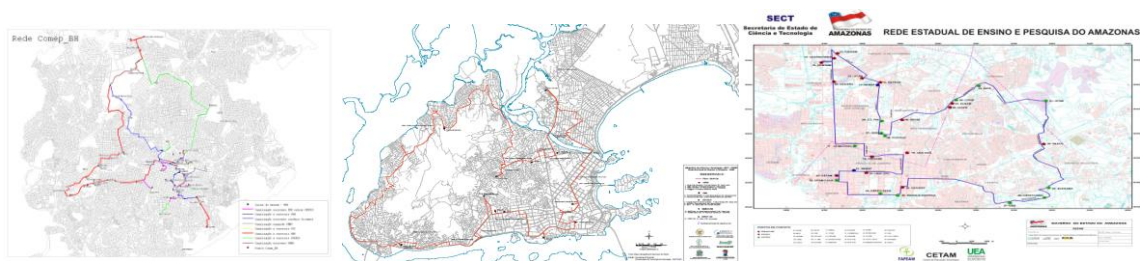
Figure -2: Redecomep, State Capital Launched 1Gbps Rings, Brazil