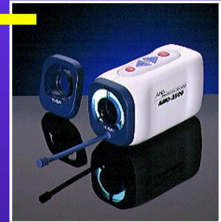
General Exam Camera